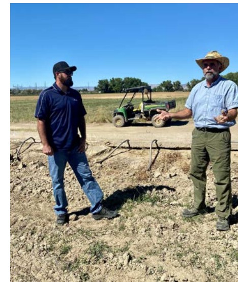
Supporting the Next Generation of Farmers and Ranchers