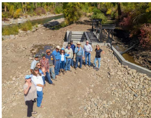
Efficient Delivery Systems