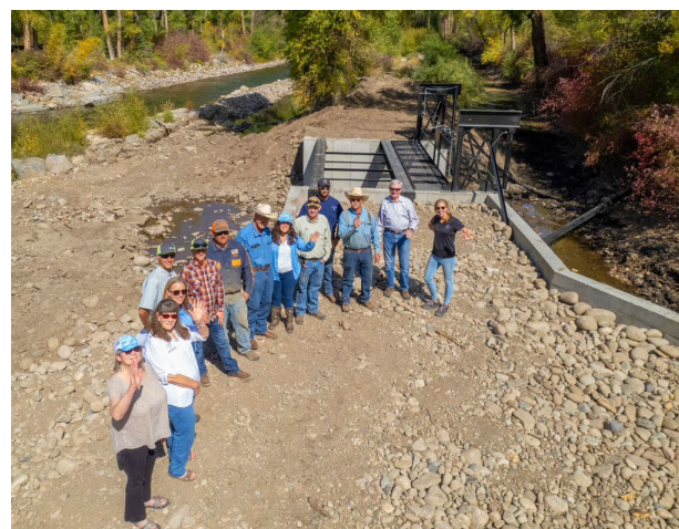
Efficient Delivery Systems