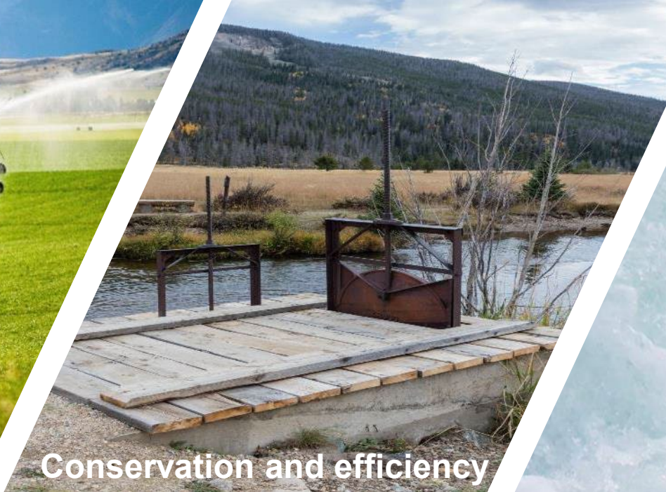
Conservation and efficiency