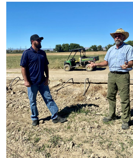
Supporting the Next Generation of Farmers and Ranchers