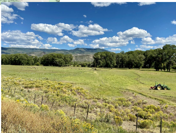
New Storage + Late Season Irrigation Water