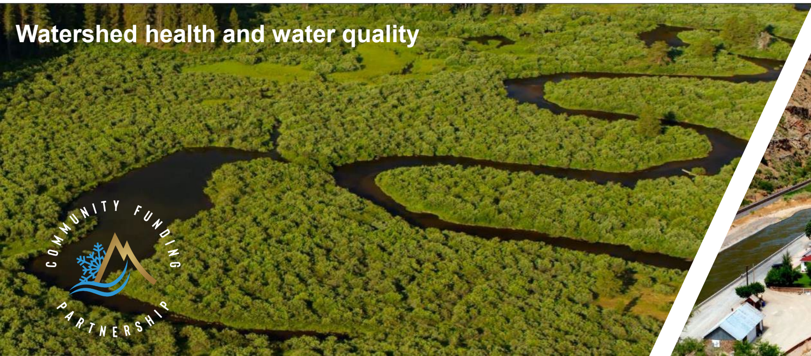
Watershed health and water quality