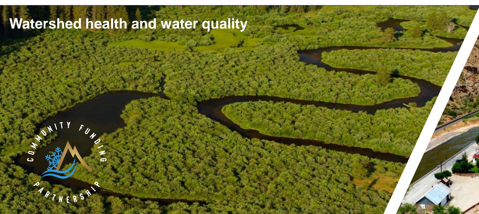
Watershed health and water quality